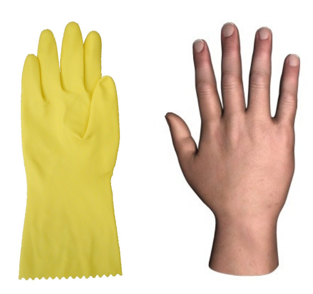
Figure 1: Deformations of a glove (left) and a solid hand (right) are an illustration of the difference between boundary and volume isometries.

Sun et al. [36] proposed using the diagonal of the heat kernel k_t(x,x) at multiple scales as a local descriptor, referred to as the heat kernel signatures (HKS). The HKS is invariant under isometric deformations of \partial X , insensitive to topological noise at small scales, and informative in the sense that under certain assumptions one could reconstruct the surface (up to an isometry) from it.