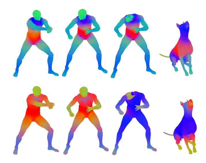
Figure 3: RGB representation of the first three components of the HKS descriptor (first row) and VHKS descriptor on the shape boundary (second row). Second and third columns show, respectively, a volume-preserving and a volume changing boundary isometries.

while both descriptors are capable of discriminating between non-isometric shapes, HKS are invariant under volume-changing isometries of the boundary, while VHKS are not.