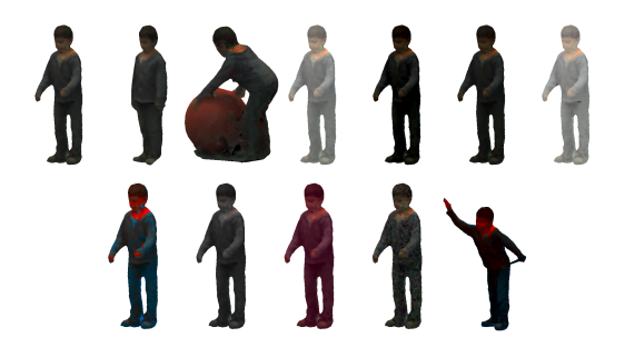
Figure 2: Examples of geometric and photometric shape transformations used as queries (shown at strength 5). First row, left to right: null, isometry+topology, partiality, two brightness transformations (brighten and darken), two contrast transformations (increase and decrease contrast). Second row, left to right: two saturation transformations (saturate and desaturate), hue, color noise, mixed; Figure 1 illustrates equi-affine and affine transformations.

the first r top-ranked retrieved shapes. Mean average preci sion (mAP), defined as mAP = \sum_r P(r) \cdot rel(r) , where rel(r)is the relevance of a given rank, was used as a single measure of performance. Intuitively, mAP is interpreted as the area below the precision-recall curve. Ideal retrieval performance results in first relevant match with mAP=100%. Performance results were broken down according to transformation class and strength.